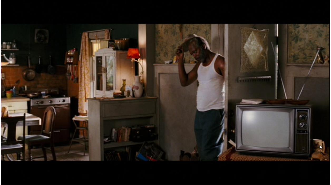
Fig. 1.5. Screenshot from Black Snake Moan (2005).

The thick atmosphere, amplified by folk tunes, country songs or delta blues music, preferably played on a jukebox or record player, is a great source of inspiration for my work, as well as the American style of architecture that was very distinct in the 50's and 60's (diners, motels, and also residential bungalows).