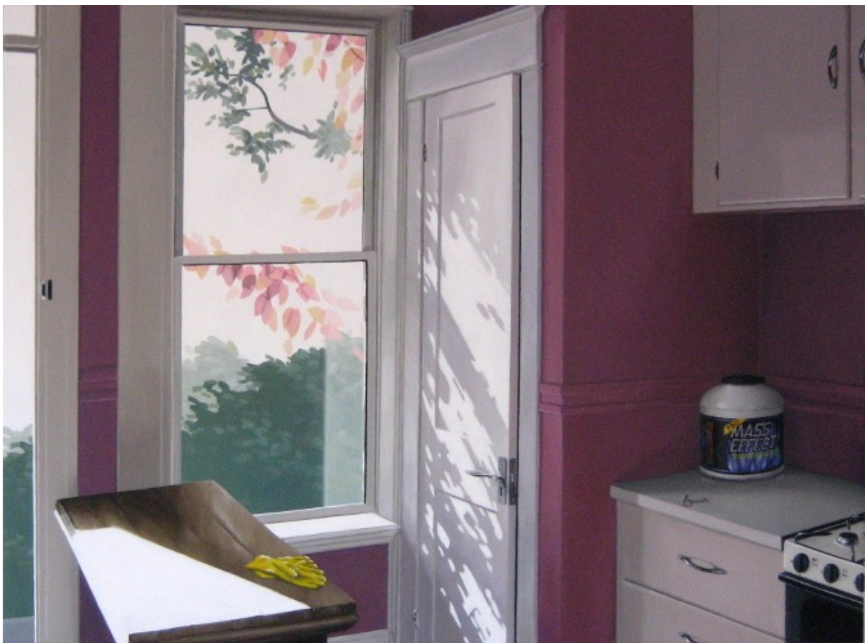
Fig. 1.3. The Closet (2013), acrylics on canvas, 73x54cm.

still, dark scenes accompanied by creepy music, leading up to a big fright usually involving copious amounts of blood and screams, in countless horror movies. Masters of suspense in the cinema-world are, in my opinion, Alfred Hitchcock and David Lynch. In their movies, inconspicuous details and scenes in which nothing seems to be happening are very important clues in revealing the plot. Some very suspenseful films I enjoyed watching are Rear Window (Hitchcock, 1953), Don't Look Now (Nicolas Roeg, 1973), Lost Highway (Lynch, 1997), The Blair Witch Project (Daniel Myrick & Eduardo Sánchez, 1999), The Village (M. Night Shyamalan, 2004) The Descent (Neill Marshall, 2005), Paranormal Activity (Oren Peli, 2007), 1408 (Mikael Håfström, 2007), No Country for Old Men (Joel & Ethan Coen, 2007). Looking at my paintings, you'd wish you could see beyond the borders of the canvas or turn around to see what (or who) is behind you. Not all is revealed, but there is a strong suggestion that a lot more is going on than meets the eye. An example is the slightly open door in The Closet (fig. 1.3).