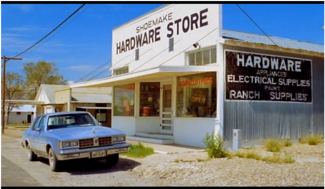
Screenshot from Paris, Texas (1984)