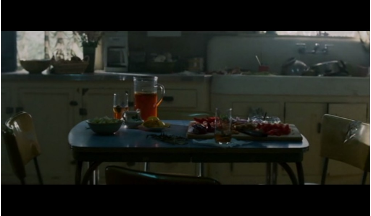
fig. 1.1. Screenshot from The Skeleton Key (2005).

Obviously, all haunted house stories and movies fall into this category. In these stories, the building itself is an actor with a dangerous personality. Also, almost every sci-fi flick and series utilizes interiors as plot devices. Space ships are -according to science fiction canon- clean, sleek, minimalistic, coldly lit, and claustrophobic. In 2001: A Space Odyssey (Stanley Kubrick, 1968), the ship, like the house in haunted house-movies, has a malevolent personality of its own.