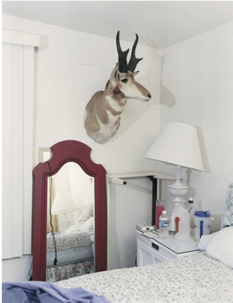
Fig. 2.1. Andrew Phelps - Higley

Many of Tarantino's movies also contain this type of comedy – for example the exact moment Jungle Julia pulls out her cell phone in an, up until that point, completely retro 70's setting in Death Proof .