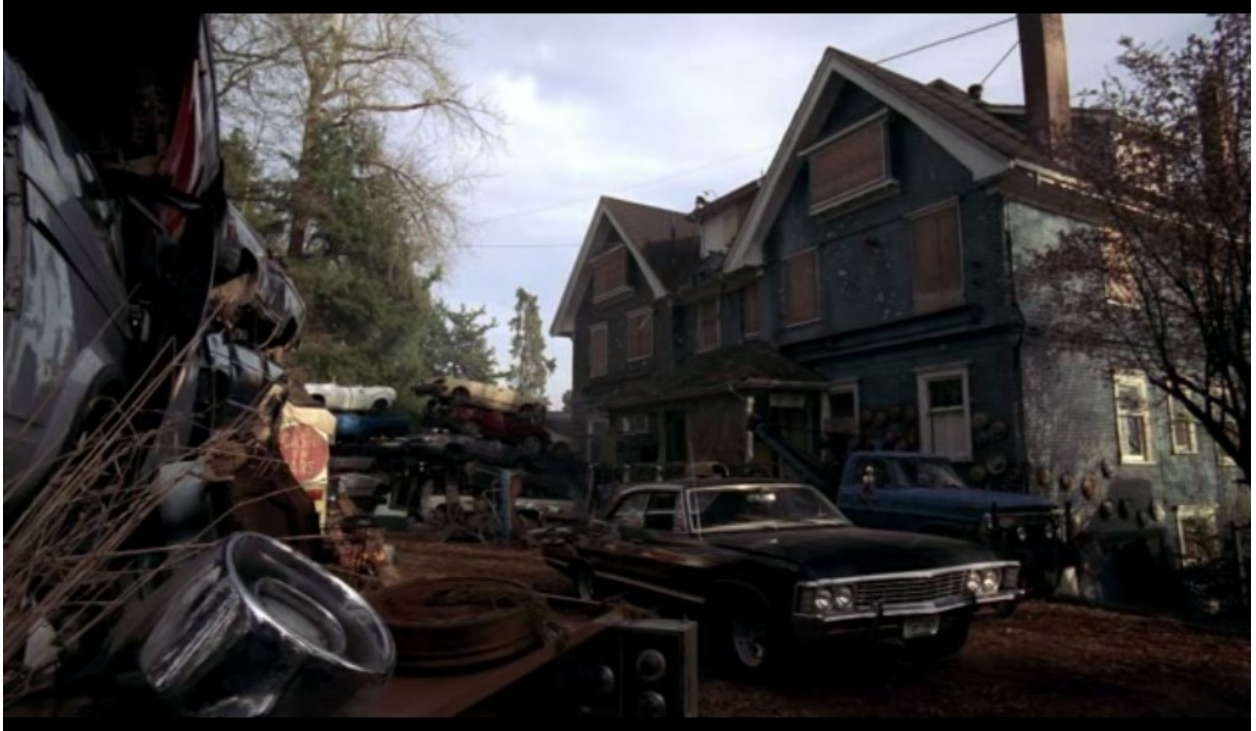
Fig. 1.7. Screenshot from Supernatural .

Other shows with a very Americana setting are The Walking Dead (Frank Darabont, 2010-present), Sons of Anarchy (Kurt Sutter, 2008-present), Breaking Bad (Vince Gilligan, 2008-2013) and Justified (2010-present).